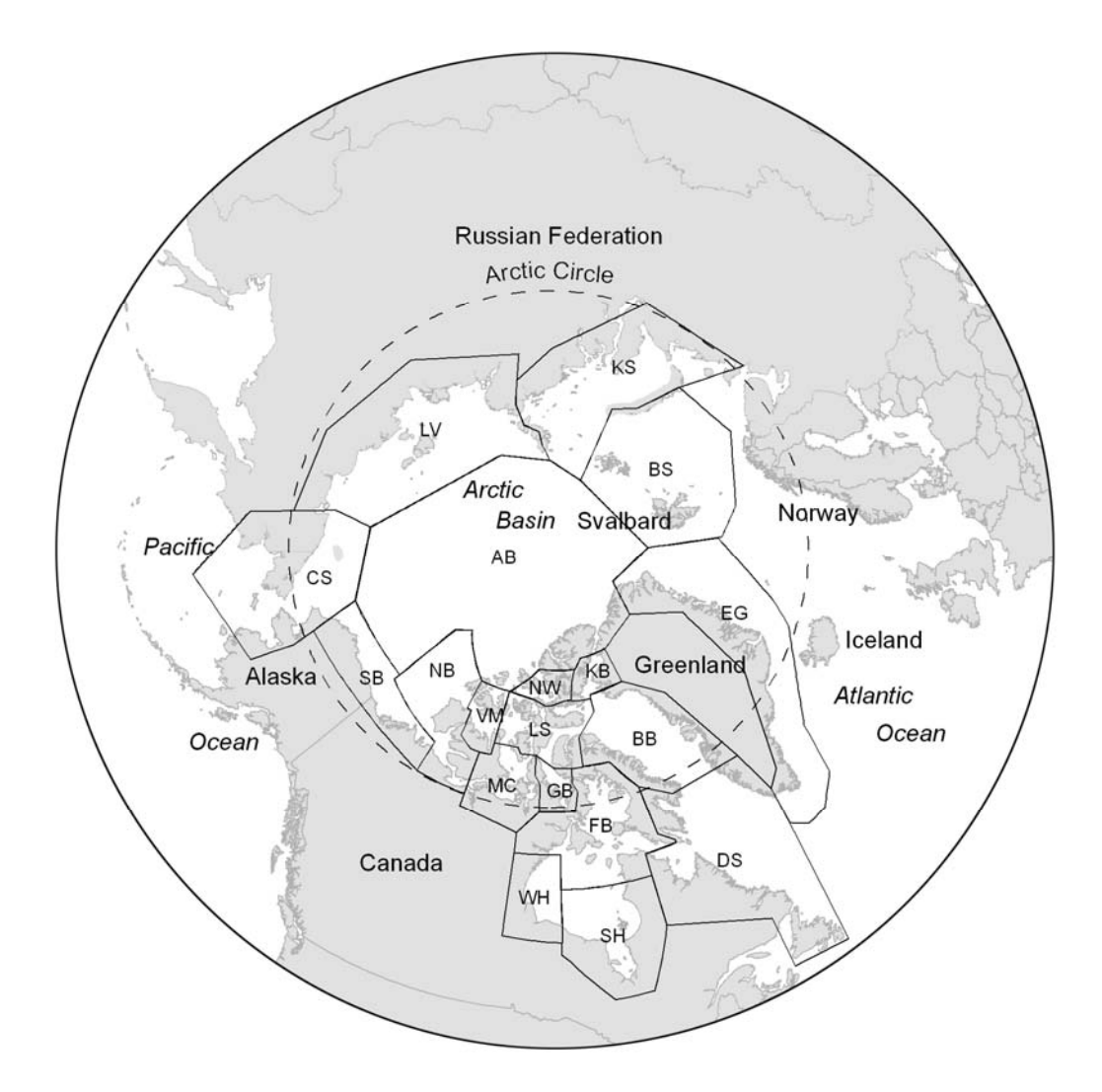
<u>Legend</u>: CS = Chukchi Sea; SB = Southern Beaufort Sea; NB = Northern Beaufort Sea; VM = Viscount Melville Sound, NW = Norwegian Bay; LS = Lancaster Sound; MC = M'Clintock Channel; GB = Gulf of Boothia; FB = Foxe Basin; WH = Western Hudson Bay; SH = Southern Hudson Bay; KB = Kane Basin; BB = Baffin Bay; DS = Davis Strait; EG = East Greenland; BS = Barents Sea; KS = Kara Sea; LV = Laptev Sea; AB = Arctic Basin