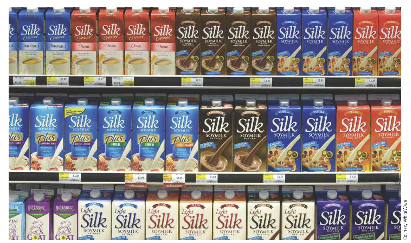
Non-dairy dairy: an array of soy milk options.

meat and dairy analogs to children should be a priority.