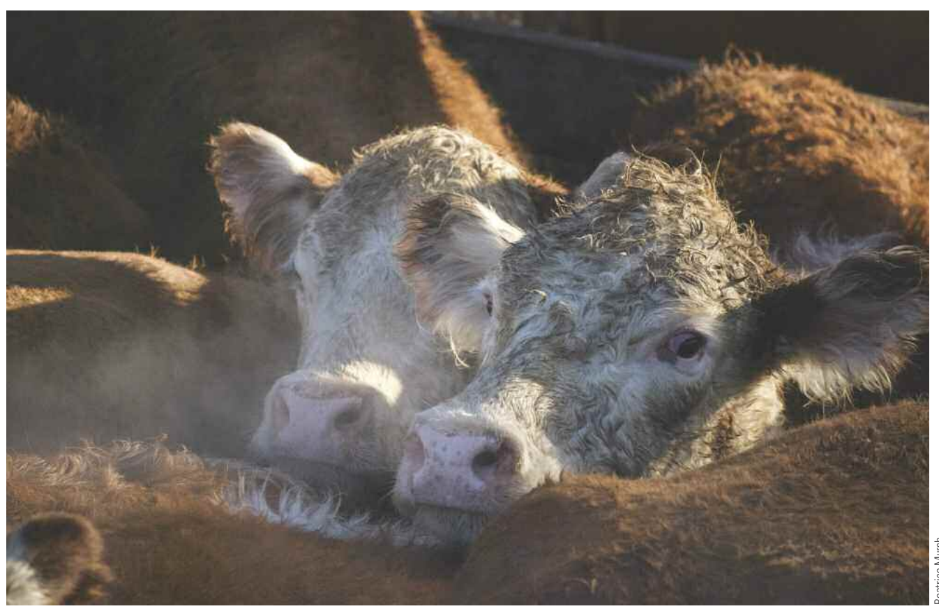
Cows respire on a cold morning at a cattle market in Buenos Aires, Argentina.

amount stored in forest cleared to create space for growing feed and grazing livestock.