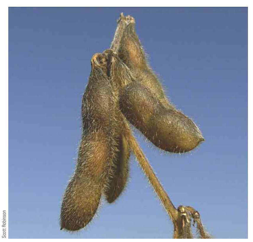
The mighty analog: soybeans await harvest on a Maryland farm.

ment projects in developing countries. If those standards were to frown upon investments in large-scale livestock projects, then a company with a meat or dairy analog project would be well positioned to attract investments.