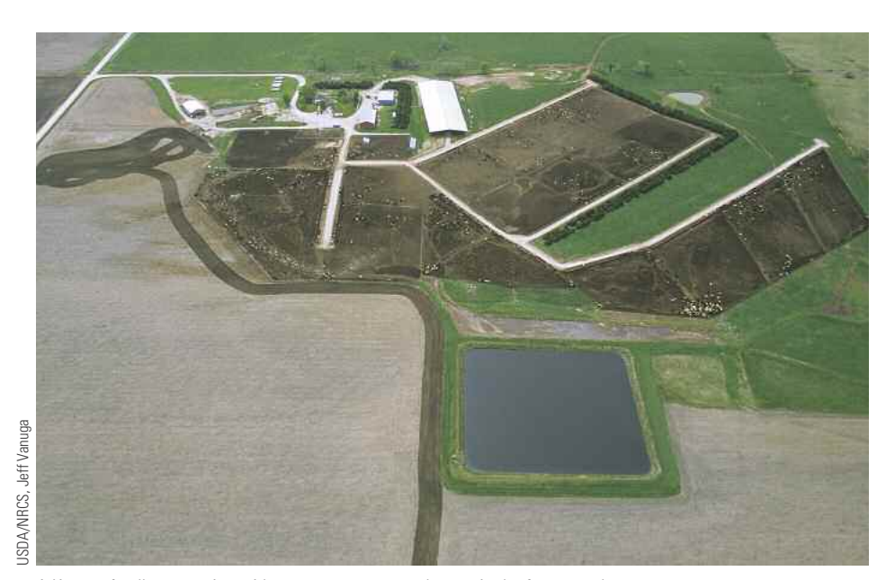
A Kansas feedlot operation with waste management lagoon in the foreground.

is by destroying natural forest. Growth in markets for livestock products is greatest in developing countries, where rainforest normally stores at least 200 tons of carbon per hectare. Where forest is replaced by moderately degraded grassland, the tonnage of carbon stored per hectare is reduced to 8.