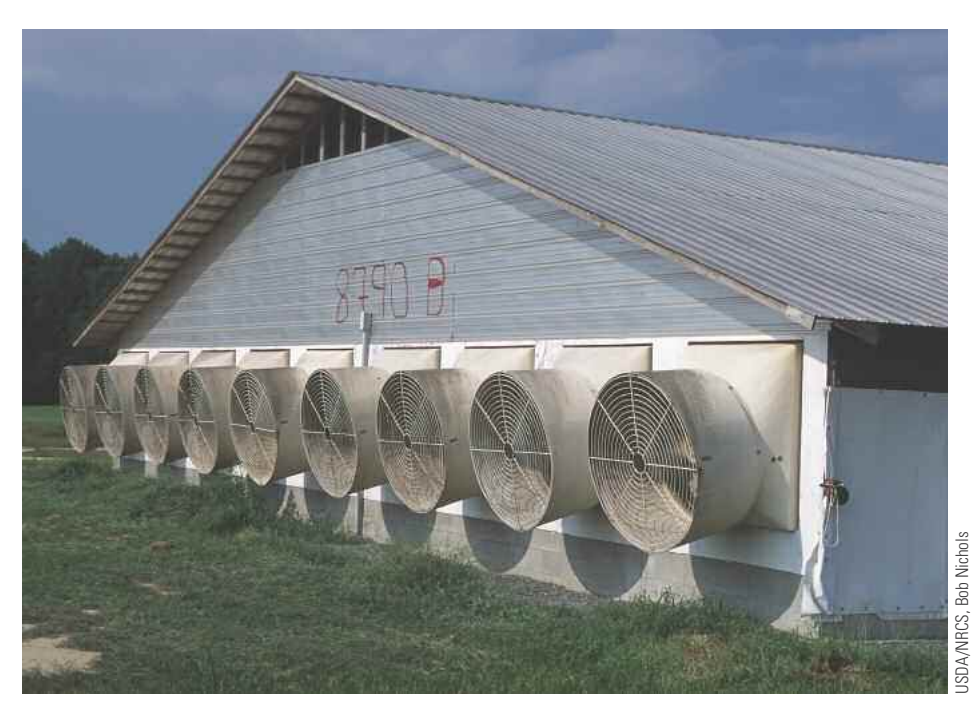
Adding more to the carbon footprint: large fans keep pigs cool in North Carolina.

Finally, we believe that FAO has overlooked some emis-